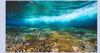
The Great Barrier Reef