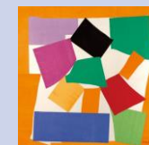
The snail by Matisse

William Morris, Henri Matisse and Paul Klee are all famous artists who liked to use shape and colour in their art work.