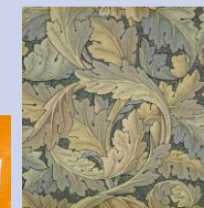
Acanthus by Morris