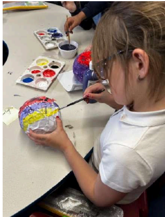
Year 2 painting their dragon eggs