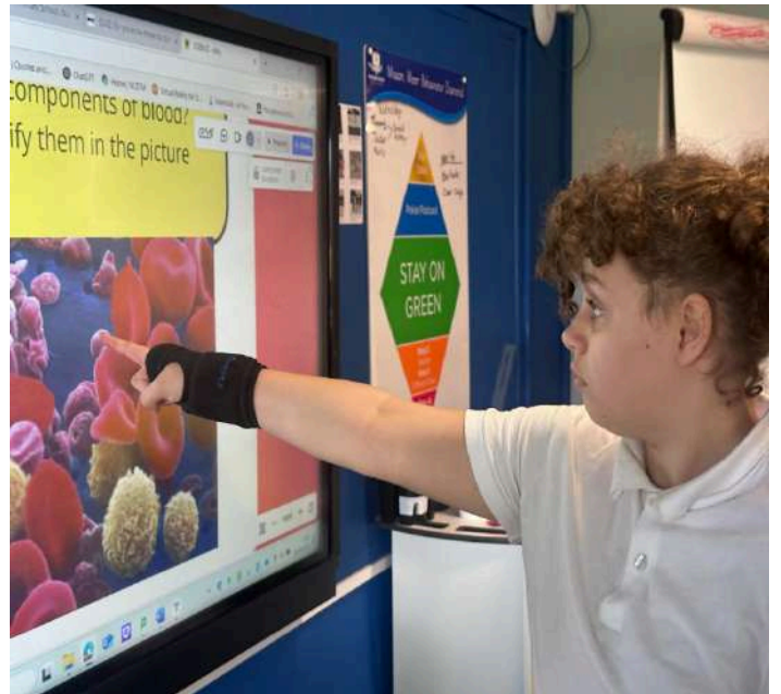
Year 6 photo gallery