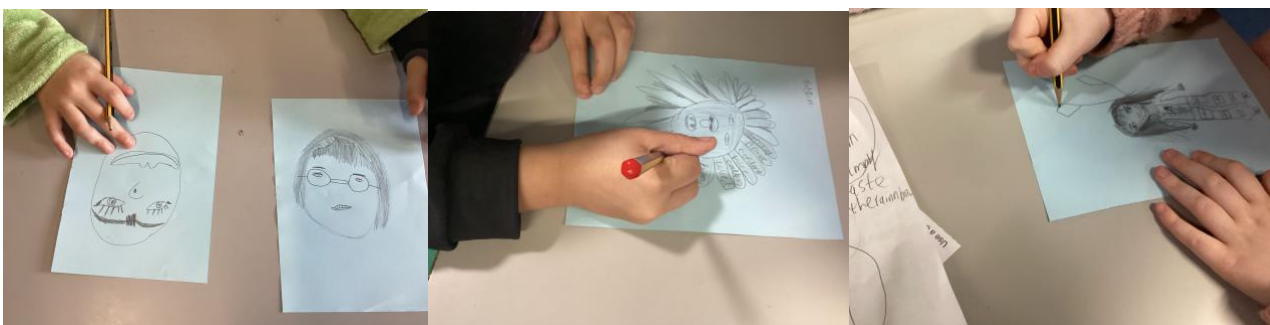
Yr 3 making their mindfulness posters