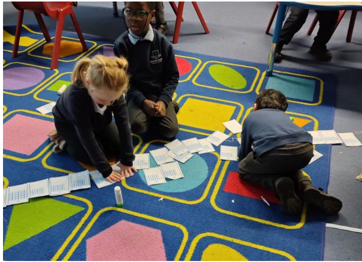
Year 1 making a class number line from 20 to 50