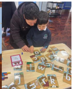
EYFS hosted a curriculum event to show off all the learning we have done in Spring 1! Thank you to the parents/carers from Nursery, Year R and The Ark who attended to share this learning experience with the children!