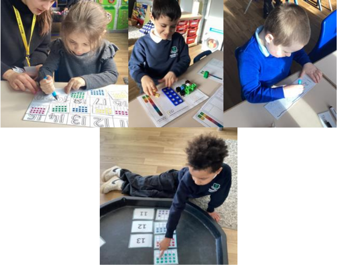
The Ark explored 11-20 in different ways!