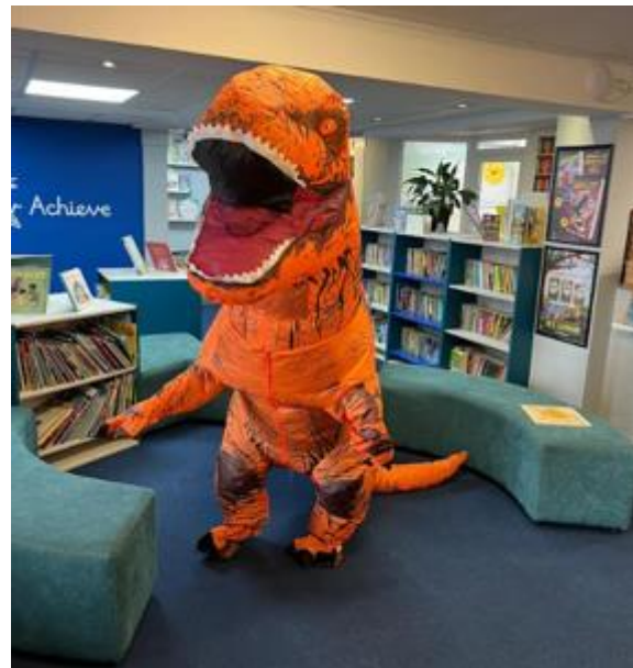
Spotted! A dinosaur in search of books!