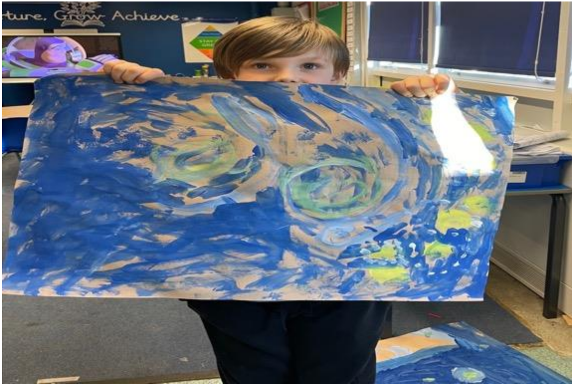
Paint your palette blue and grey...and yellow and white.