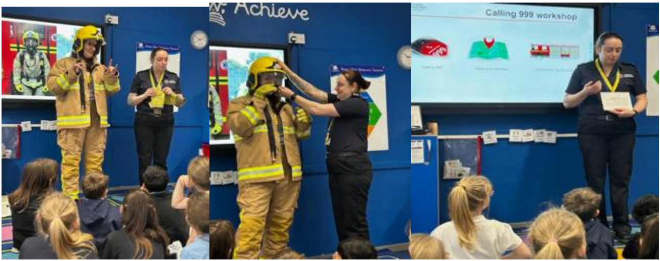
Year 2 - Fire Safety Talk