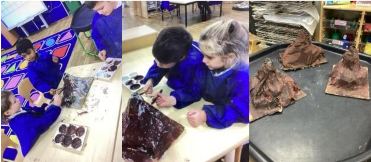
Year R created their own volcanoes!