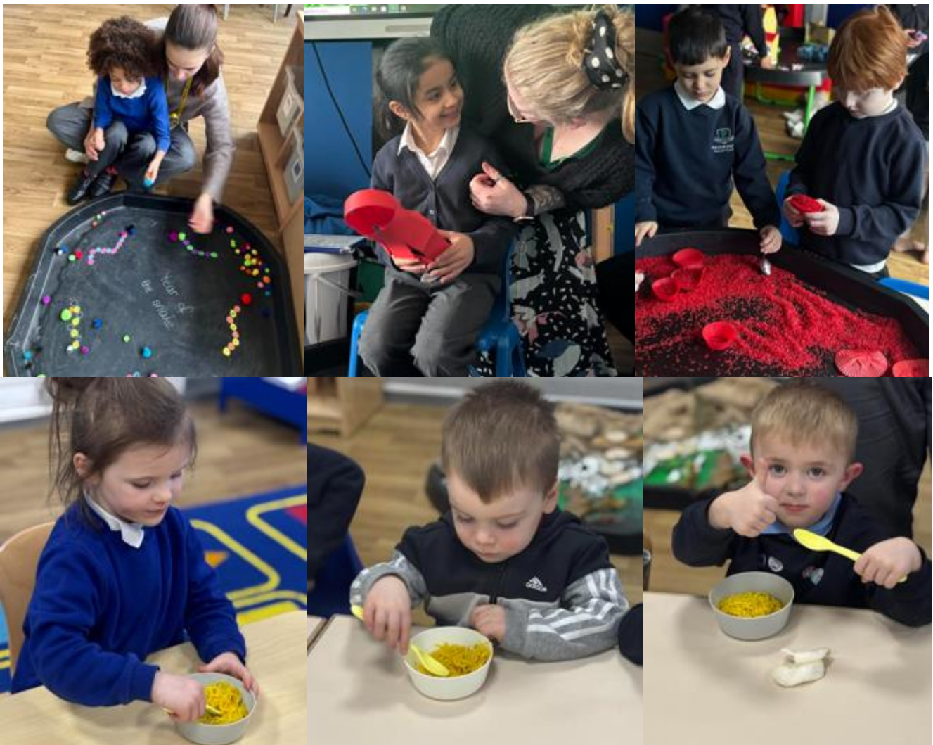
EYFS learnt about Lunar New Year! They explored the year of the snake, the lucky colour red, made lanterns and tried new foods! They loved learning about a different culture and festival. PE with year 2 and 3.