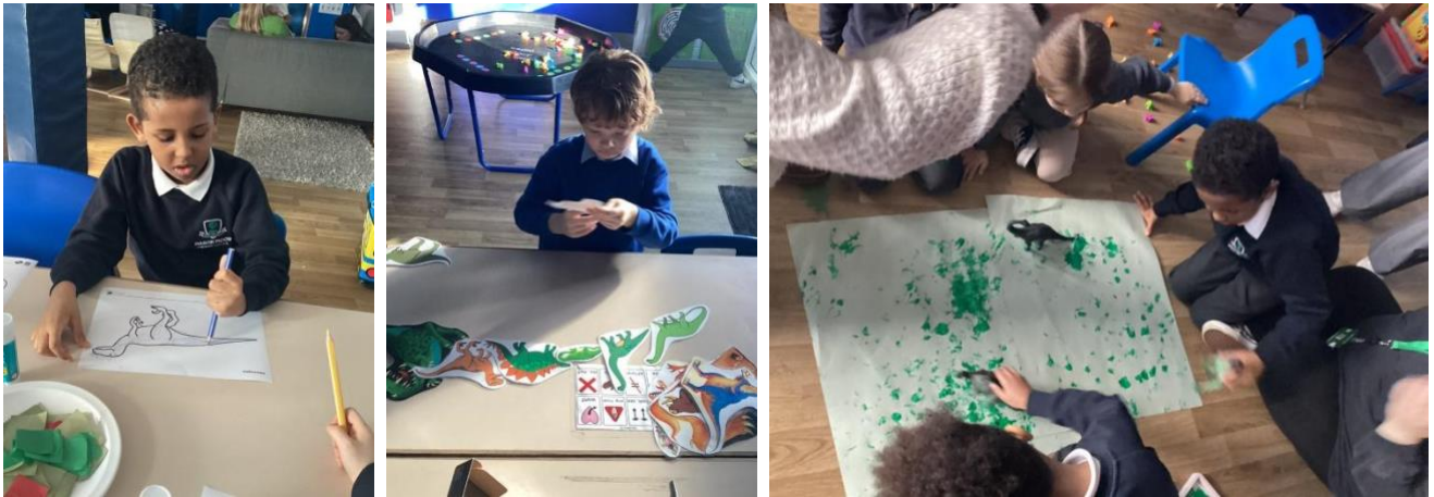
Exploring dinosaurs in the Ark!