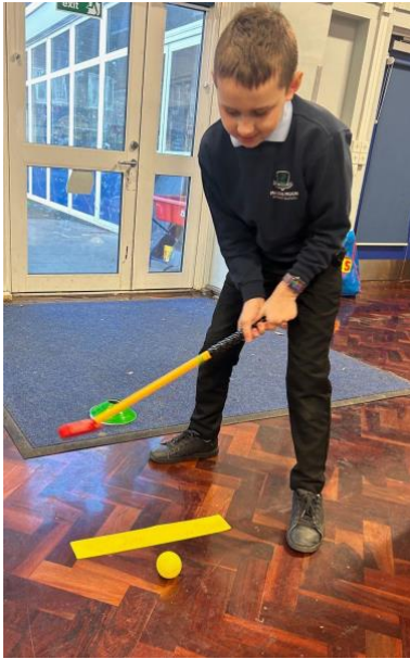
Field of Dreams