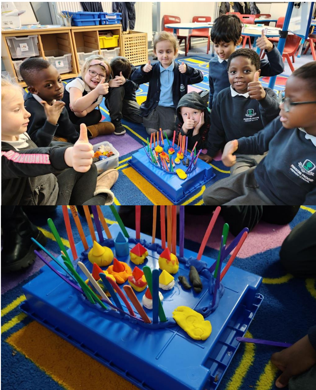
Year 1 build a rainbow hillfort!