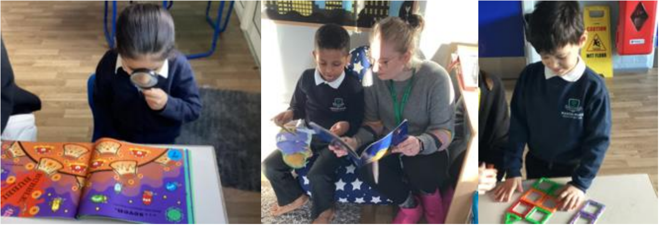
The Ark exploring Space books and activities.