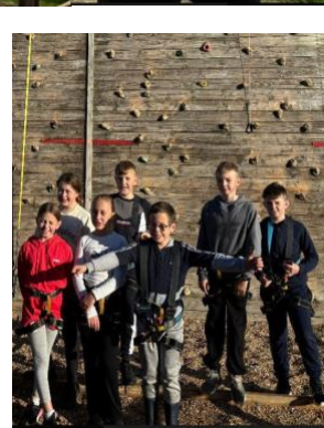
Osmington Bay 2024