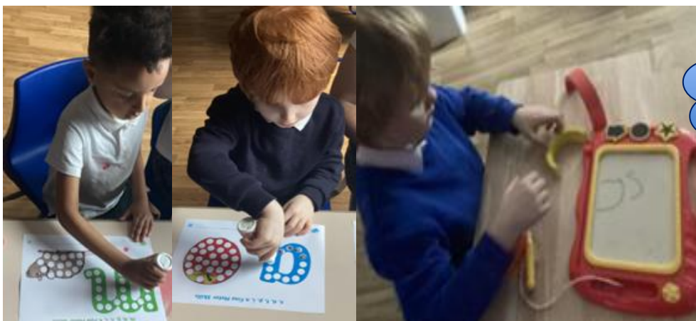
The Ark – mark making and literacy