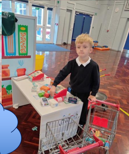
Year 1 – enjoying role play in different jobs.