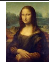
Leonardo da Vinci