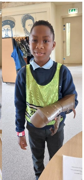
Year 3 trip to Hampton Court last week.