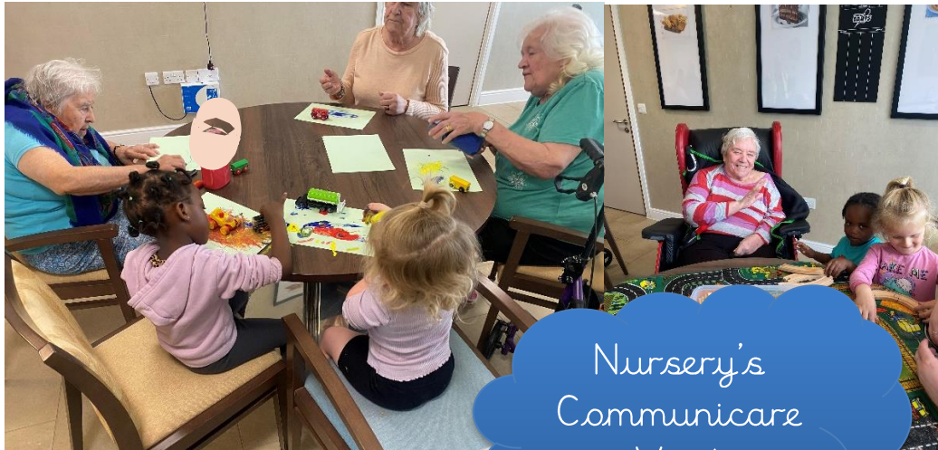
Nursery's CommuniCare Visit