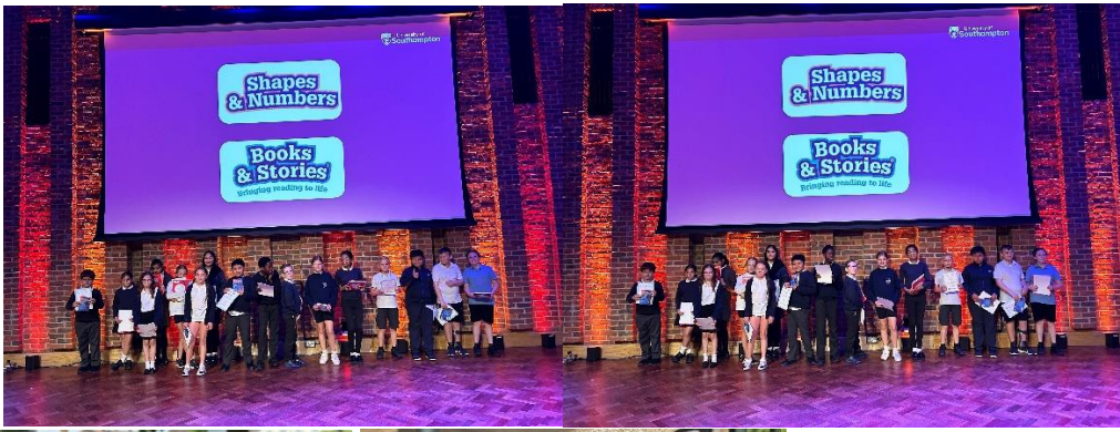
Year 6 Graduation at the University.