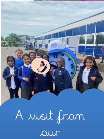
A visit from our Attendance Clock!