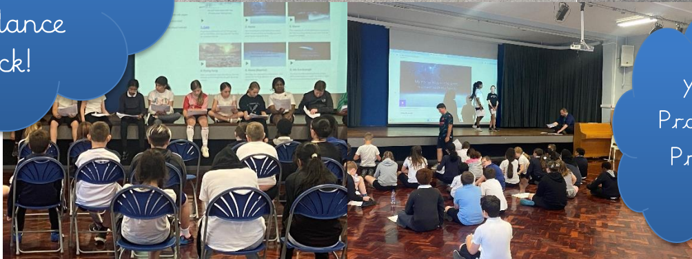
Year 6 Production Practise!