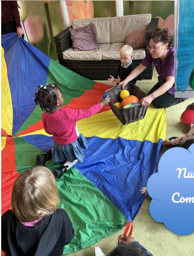
Nursery at Communicare