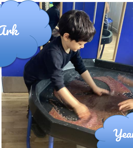
Year 3 Art