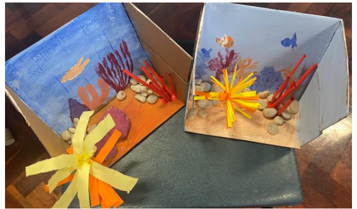
Year 2 making pyramids!