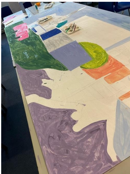
A sneak peek at our upcoming art project!

Plenty of highlights from the week, including a celebration of the Year 3 trip!